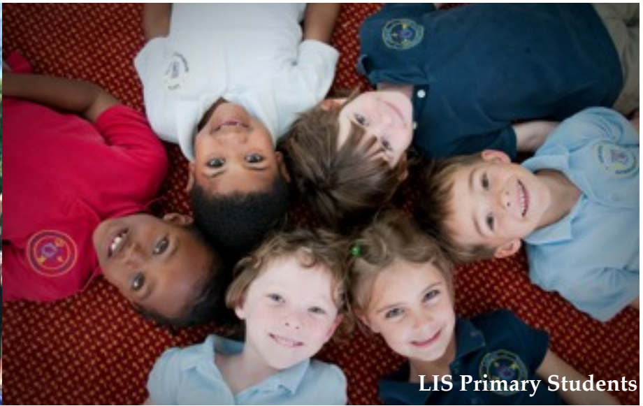
LIS Primary Students