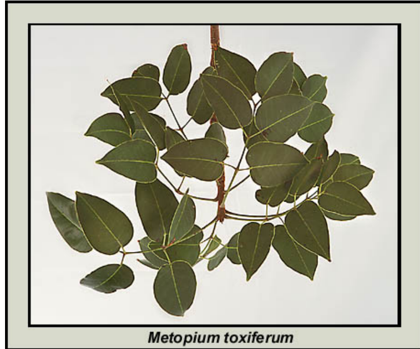
Twigs and leaves

Poisonwood, also known as Florida poison tree or hog gum, is related to poison sumac and poison oak, all members of the cashew or sumac ( Anacardiaceae ) family. This beautiful tree grows abundantly in the Keys and can also be found in various ecosystems in southern Florida. Its range in tropical America extends from Florida to the Bahamas, Honduras, and the West Indies.