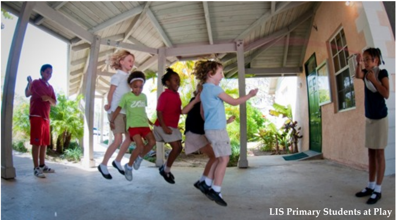
LIS Primary Students at Play