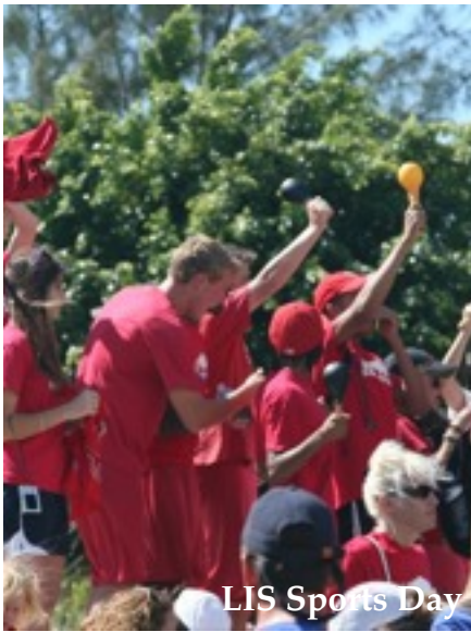
LIS Sports Day